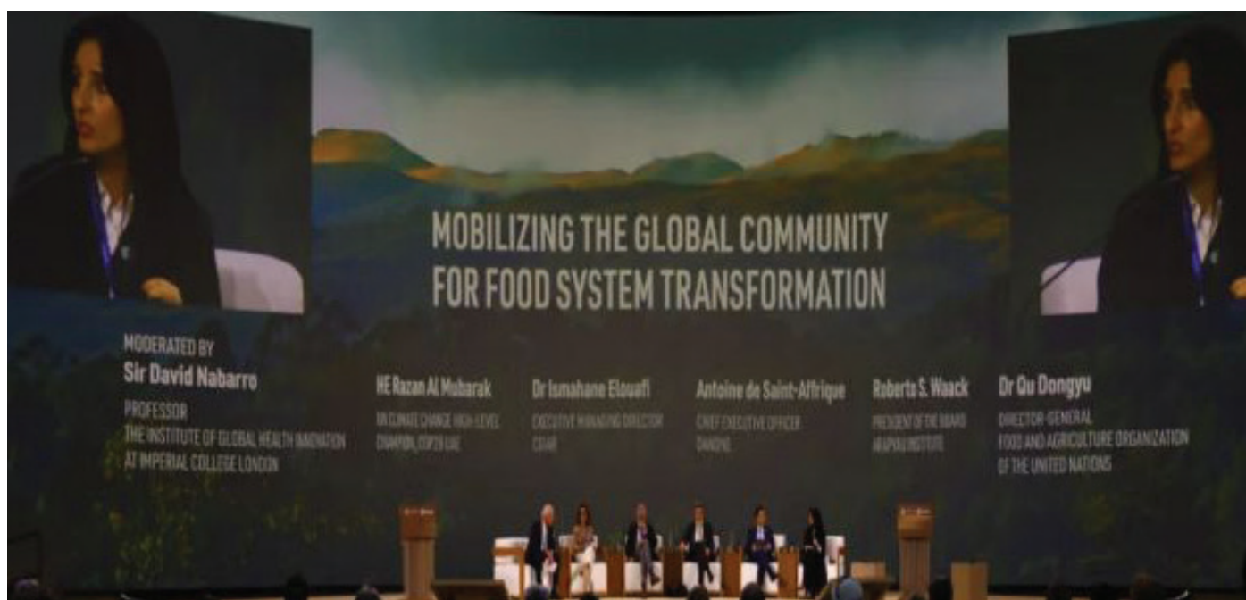
COP28.com Courtesy Photo of the COP28 Session on Food and Agriculture System

In Dubai, our actions therein included the provision of information for sessions and advocacy, participating in related side events, advocacy, and lobbying. This year, our participation advocated for agroecology to be considered as the rightful course and recourse, not only for resilient food and agricultural systems but also an important climate change action and recourse that in a way links with other global sustainable goals. We were desirous of agroecology being included in the COP28 outcomes texts and pledges.