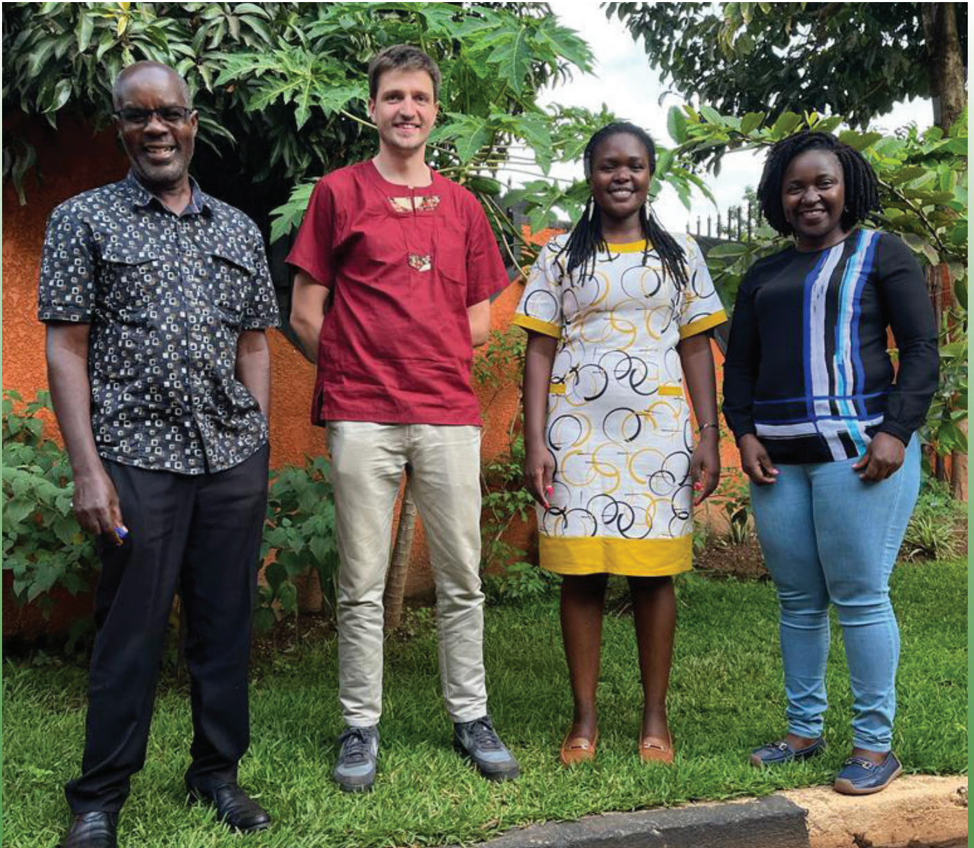
From Left PELUM RS SG, Country Representative and Advisor from Broederlijk Delen (BD), PELUM RS HOP after a meeting at the RS office

PELUM Association Regional secretariat had engagements with potential partners during the quarter both virtually and physically and continues to look forward on nurturing these relations.