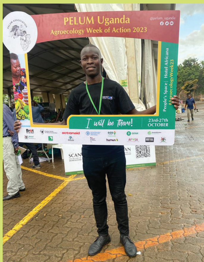
PELUM RS staff during the PELUM Uganda Agroecology Week of Action