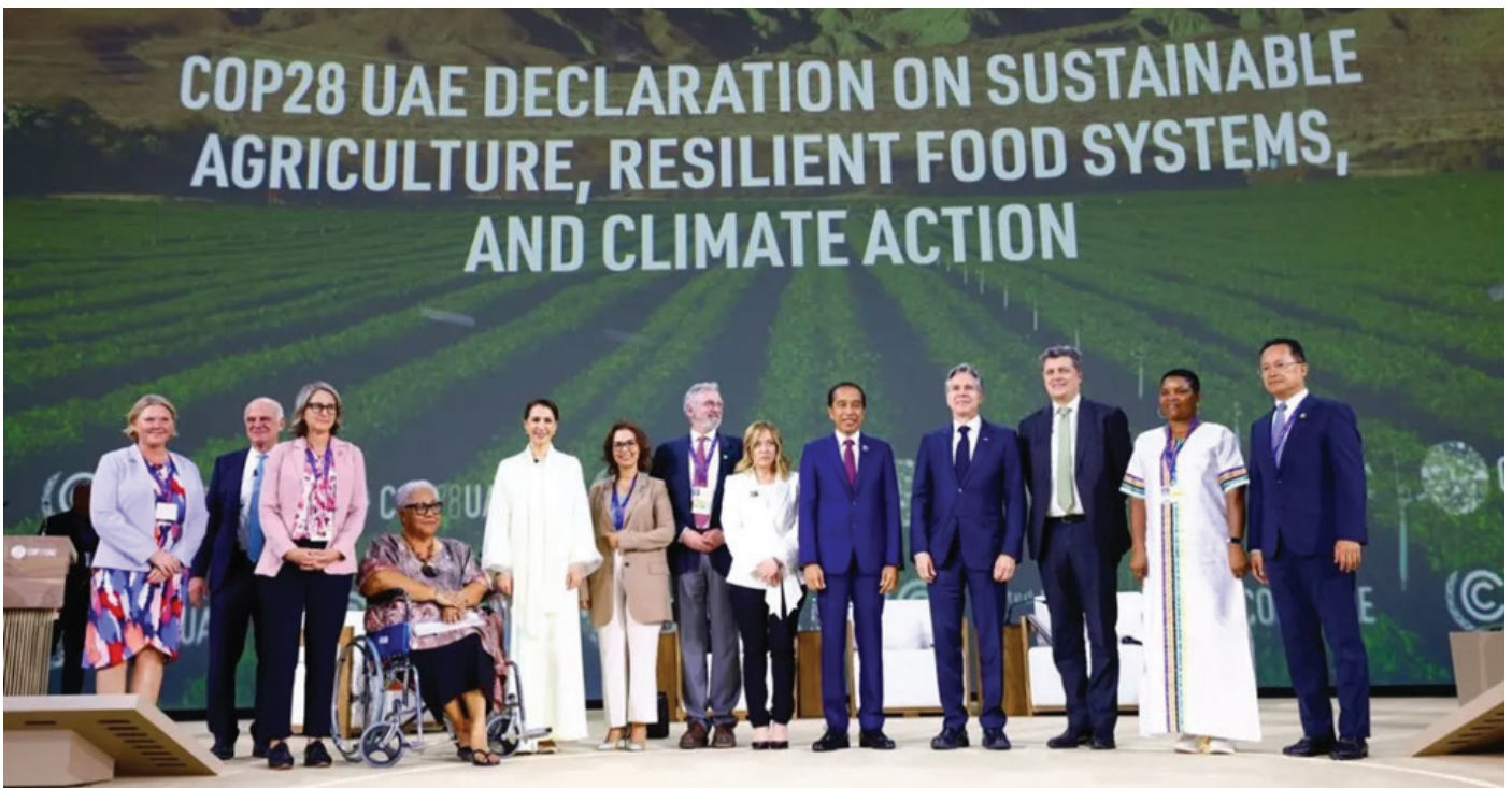
Courtesy photo of the various leadership at the helm of the declaration

COP28 had various agendas, that revolved around presenting the first global stocktake (GST) report, which is the Parties' tracking system on the progress of the 2015 Paris Climate Agreement ( GST Sourcefile:///C:/Users/USER/Downloads/sb2023_09E.pdf ), reaching a consensus and decisions for proceeding climate actions. Unique from the previous high-level documents used in the COP, the 2023 global stocktake report, was applauded by stakeholders in the food and agriculture sectors for including some text on the food and agricultural system (section 55 of the GST), thus, a step in the needed direction. One could equally attribute the food and agriculture pledges and declaration that gathered signatures from over 130 member states at the start of this step, in addition to other contributions. The pledges on food and agricultural actions were part of the 11 main climate actions pledges package such as the loss and damage funds, powering with coal end, and renewable energy tripling, among others that are also a considerable positive multi-sectoral approach to ensuring the desired wellbeing of society.